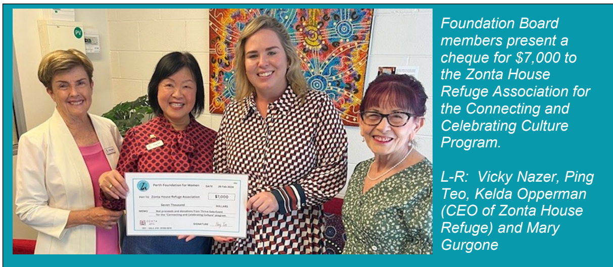
Foundation Board members present a cheque for $7,000 to the Zonta House Refuge Association for the Connecting and Celebrating Culture Program.

Launched by the Zonta House Refuge, this program aims to promote cultural awareness, understanding, and respect by providing opportunities for staff, clients, and the wider community to learn about different cultures and celebrate diversity.